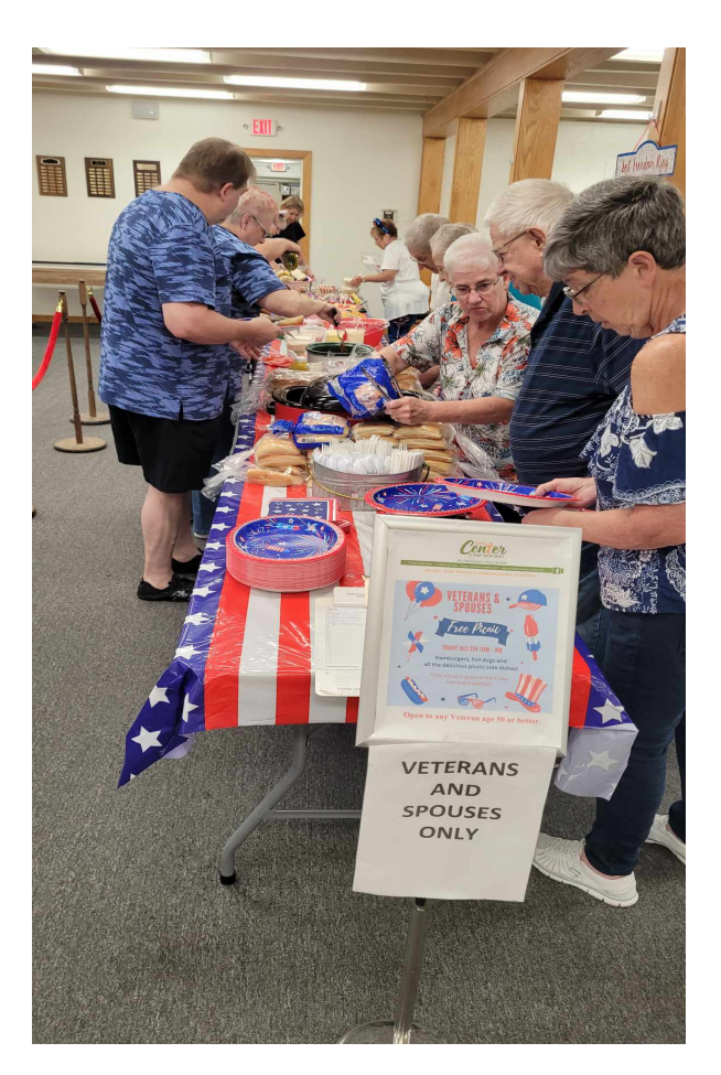
The July 5<sup>th</sup> Veteran's Picnic was very well attended.