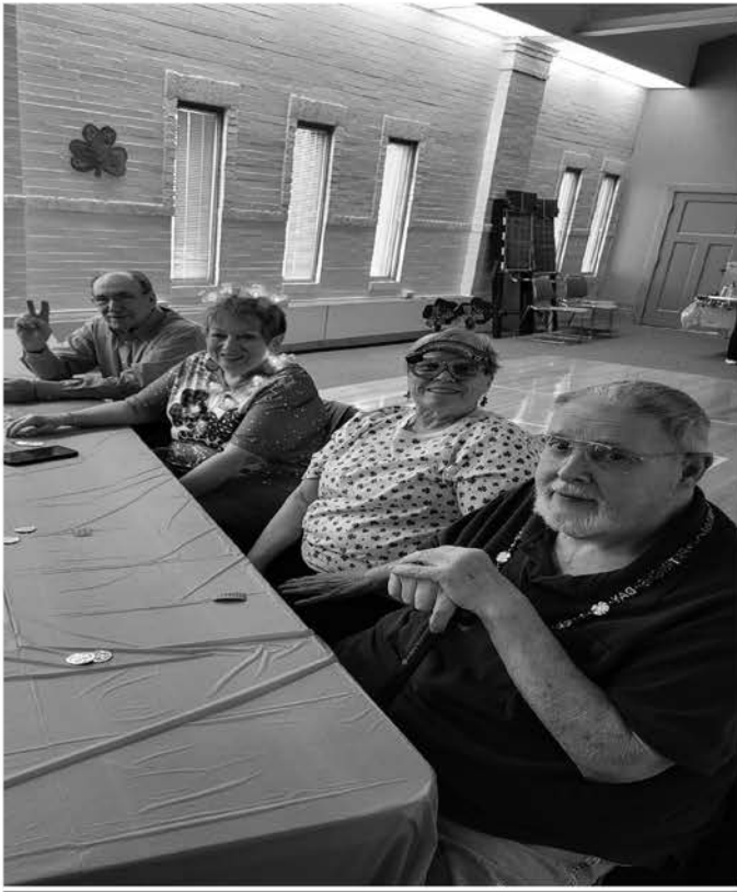
Fun was had by all at the March 15 th St. Patty Dance!